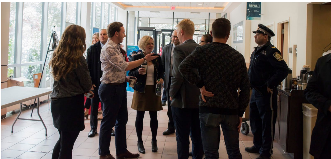
Premier Notely Visits UASU 2018

We were thrilled to be visited by the right Honorable Premier Notely on Thursday. The Premier and Minister Schmidt were on campus to announce 400 new tech-related seats for students across the province, 25 of which will go towards after education in computer science at the UofA. The first step on province-wide capacity, we hope to continue to see such investments. The Minister and Premier publically stated that the tuition review should be released in this sitting of the Legislature, which is of incredible importance to students. I have been working on that file for nearly 18 months and thrilled to see that public commitment to legislation for the fall.