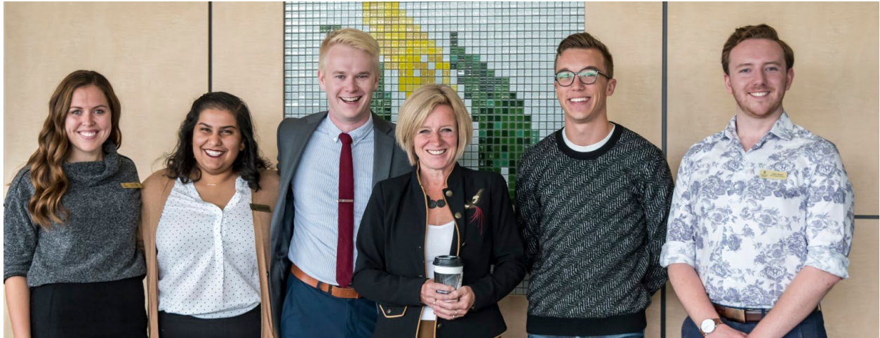
Premier Notely with UASU 2018 Executive Committee